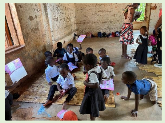
Children playing freely during break time

The caregivers consistently plan and implement activities. They operate with a structured timetable akin to that of elementary schools, ensuring comprehensive educational instruction.