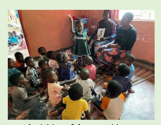
Activities of 4-year-olds