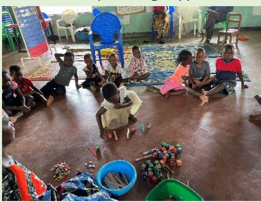
Currently studying shapes