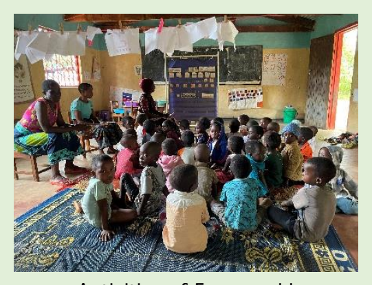
Activities of 5-year-olds

Similarly to facility D, five caregivers rotate in conducting activities. With support from NGOs, the facilities and teaching materials are well-equipped. The caregivers are very dedicated to their activities, and they conduct activities segmented by age groups of 3 to 5-year-olds.