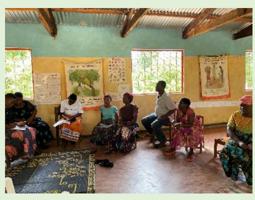
Meeting with the community