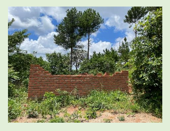
Under construction next to the CBCC Clinic for children under 5 years old