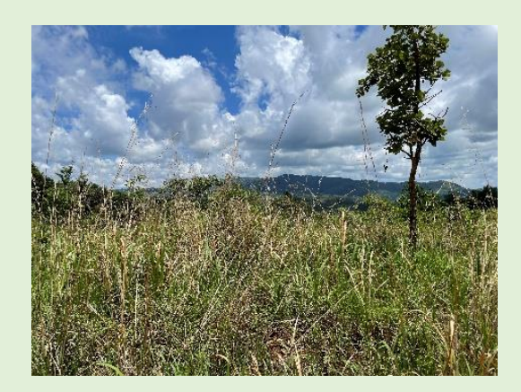
Planned site for elementary school