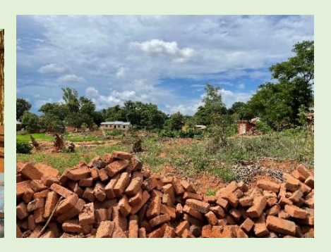
Planned site for new facility