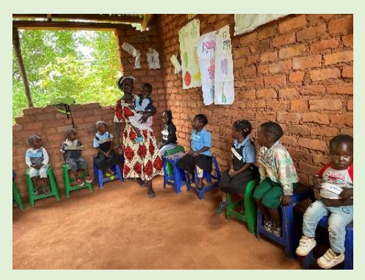
Description of activities