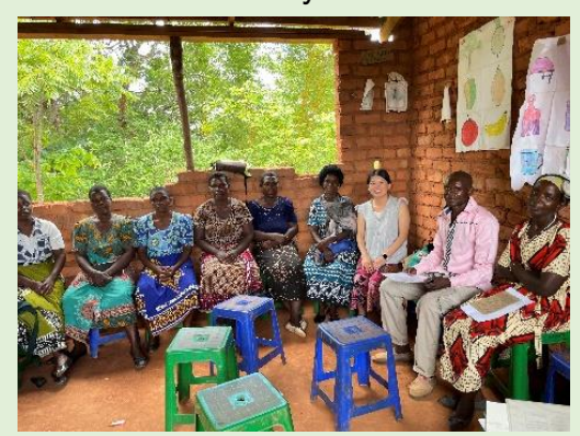
Discussion with the community