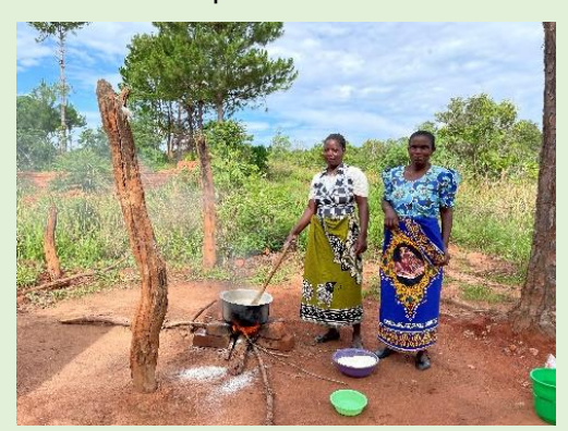
Preparation of porridge