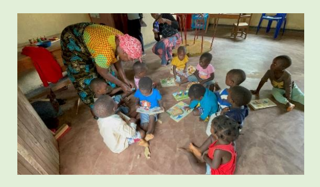
Activities of 3-year-olds