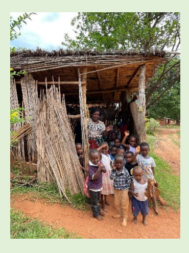
Entrance of the facility

B facility, which started in 2021, operates in a building constructed by the community. The village chief has generously donated land for future construction of a CBCC by the community. We look forward to monitoring progress in the coming months.