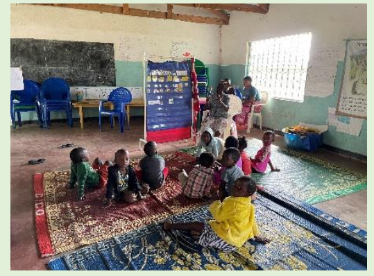
Starting activities: Learning about dates

Five caregivers rotate in conducting activities. With support from NGOs, the facilities and teaching materials are well-equipped. Currently, with minimal NGO support, the community continues to sustain caregiver activities while providing support.